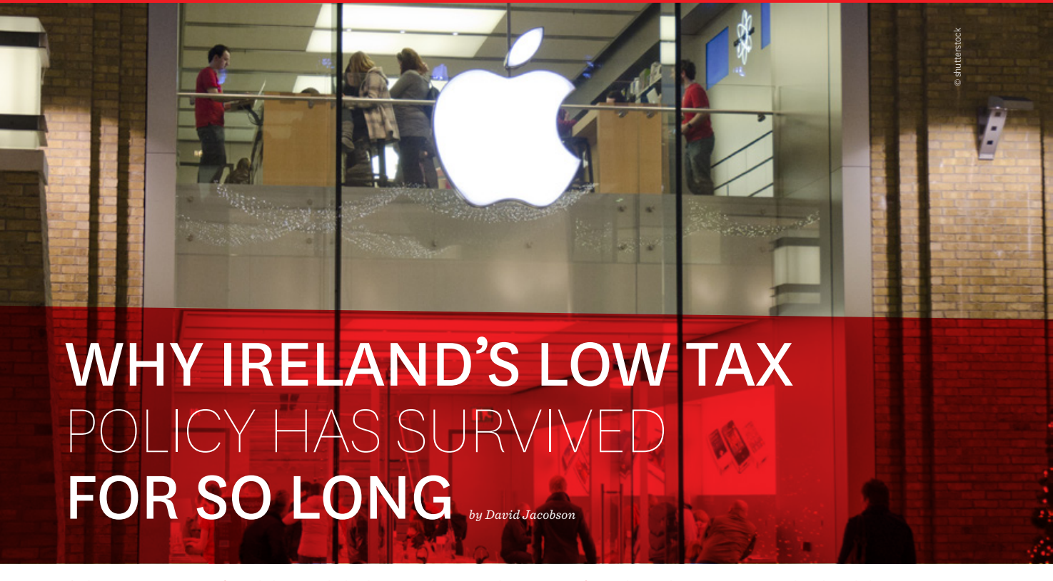
The EU Commission found that Apple had received a special treatment from the Irish government and ordered the company to pay some €13 billion.

Social, fiscal and climate justice: the right-left cleavage is still alive!